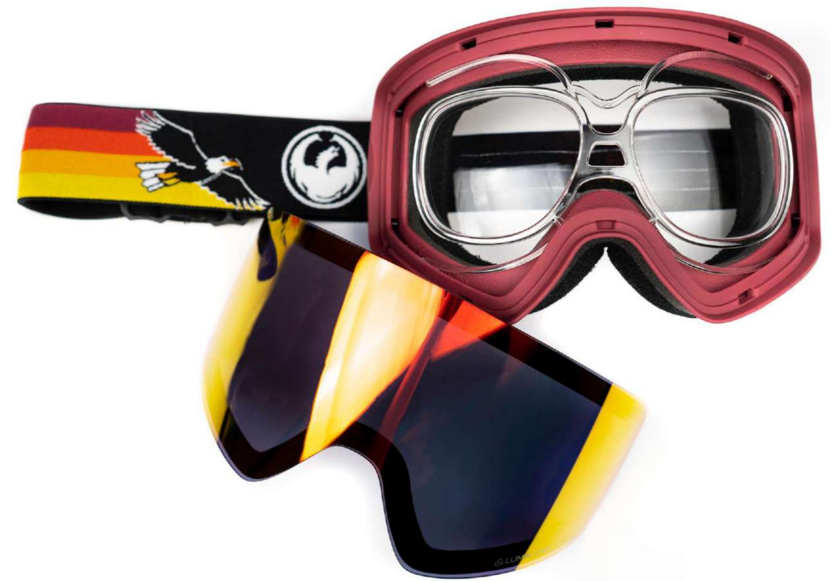
Dragon PXV with SportRx prescription goggle insert